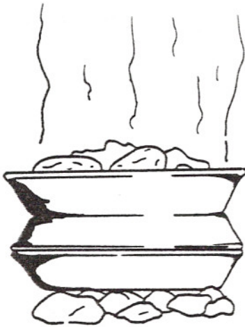
Pie Pan Dutch Oven